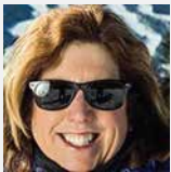
Maine PR Maven @mainepmaven

“Imagine South By Southwest, the Grammys and Cirque du Soleil all mashed up, stitched together by a double rainbow and attached to the back of a honey badger.” -Rich Brooks